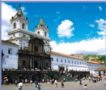
Iglesia de San Francisco, Quito, Ecuador