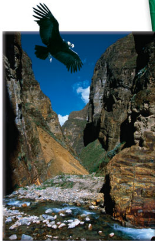
Vista del cañón del Colca, Perú