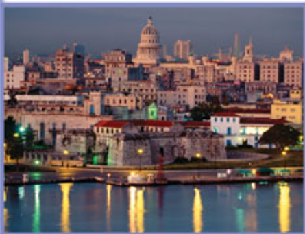
Vista de la ciudad de La Habana, Cuba