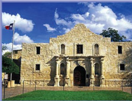
El Álamo, San Antonio, Texas