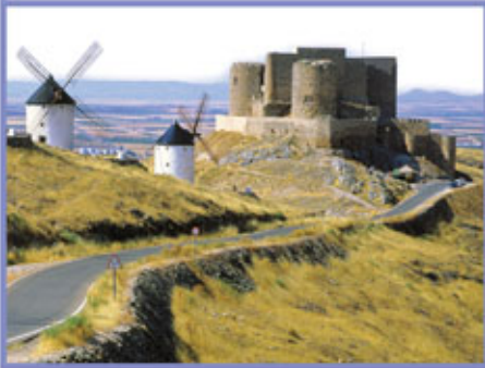
Molinos de viento en las llanuras de Castilla-La Mancha