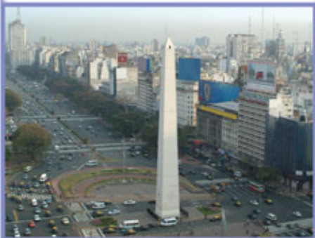
Vista de la ciudad de Buenos Aires, capital de Argentina

Mapas del Cono Sur ... 360, R8 Almanaque ..... 360 La historia del Cono Sur .... 362 El arte del Cono Sur ..... 364