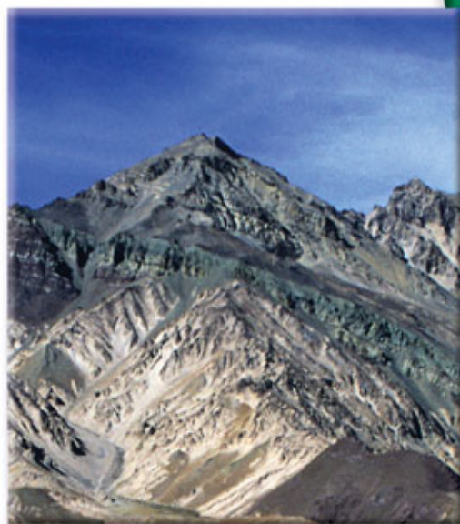
Picos del cerro Aconcagua en la cordillera de los Andes, Argentina