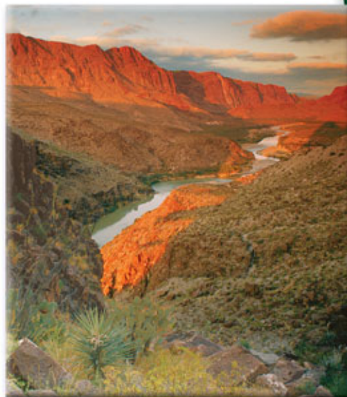
Vista del Río Grande