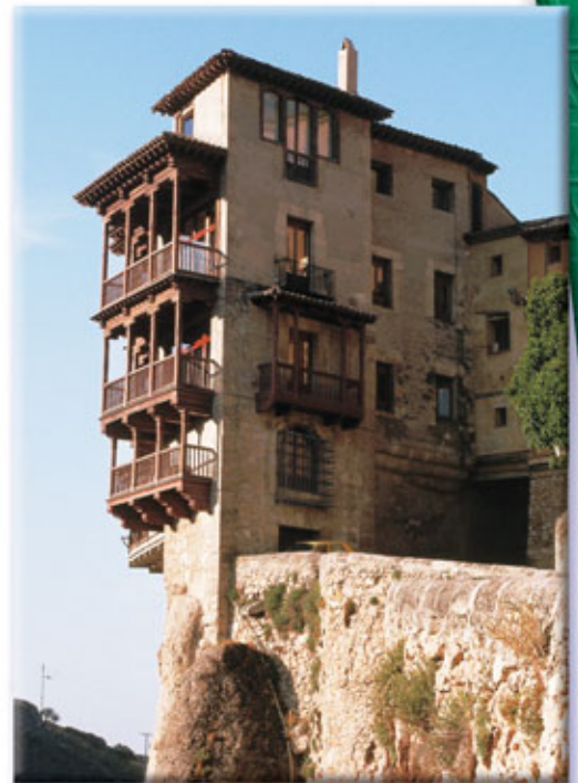
Vista de las famosas casas colgadas en Cuenca, Castilla-La Mancha