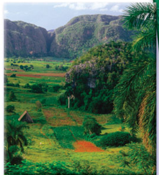
Zona agrícola en el oeste de Cuba